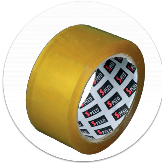
HOLMELT KOLİ BANDI