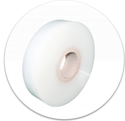
DİLİMLENMİŞ STREÇ FİLM