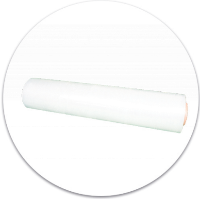
EL TİPİ STREÇ FİLM