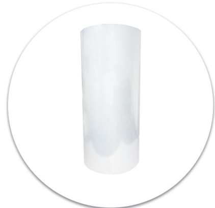
SUPER POWER STREÇ FİLM