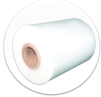
MAKİNE TİPİ STREÇ FİLM