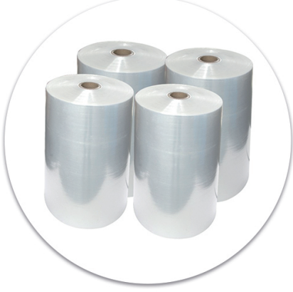
JUMBO STREÇ FİLM